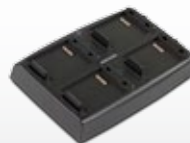
• 94A150039 4-Slot Battery Charger