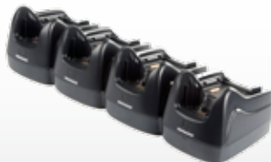
• 94A150037 4-Slot Charging Dock • 94A150038 4-Slot Ethernet Dock